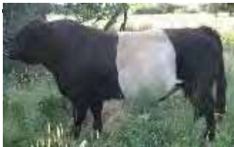
Sire - Pine Gully Park Alto