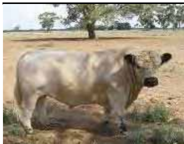
Sire-Glenayr Cannon Boy

Her Dam—Globex Sally is an exceptionally well put together solid female who has continuously produced great calves.