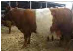
Dam- Bonnibelt Zahara