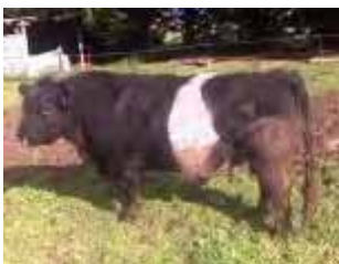
Sire - Rowsley Park Yogi

Comments: Wilkamdai Haranni is a lovely, well put together heifer with great bloodlines.