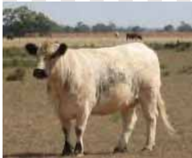
Dam - Globex Sally