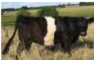
Dam - Wilkamdai Nahla

Giovanni has been farm collected and the owners reserve the right to retain his semen for private sales.