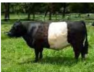
Dam - Wilkamdai Chiquita