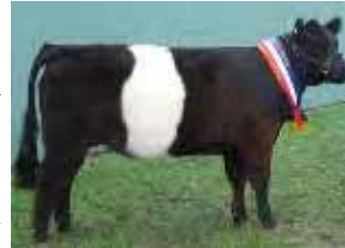
Dam - Grandview Faith

We expect Grandview Heath to be a Miniature Belted Galloway producing calves with wonderful carcass traits and hides.