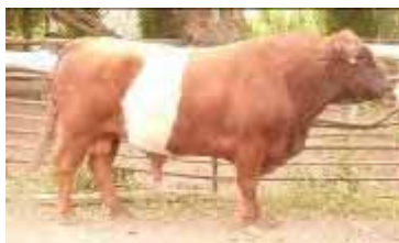
Sire- Budawang Denton

Budawang Hero is later maturing young bull calf with excellent structure and temperament. He is already showing signs of developing sire attributes including good carcass traits.