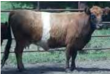
Dam - Budawang Zophie