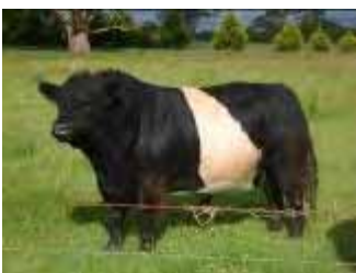
Sire - Wilkamdai Bartholomew