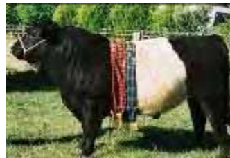
Sire - Wilkamdai Zikomo