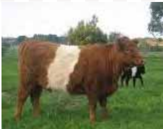
Dam - Wilkamdai Crista