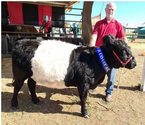
Fraser Coast Show - Freedom Rise Shadow