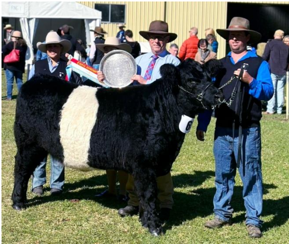
7Hills Southern Belle