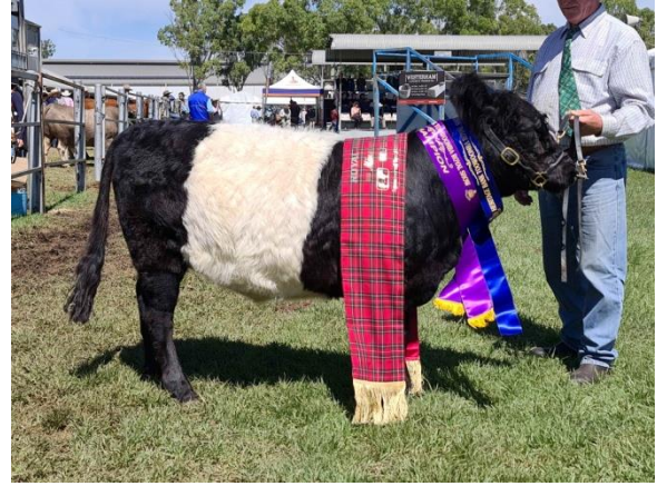
Toowoomba Show –Grand Champion Miniature Female Freedom Rise Shadow