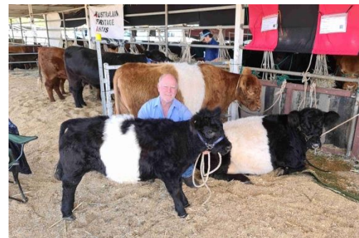
Freedom Rise Stud at the Fraser Coast Show