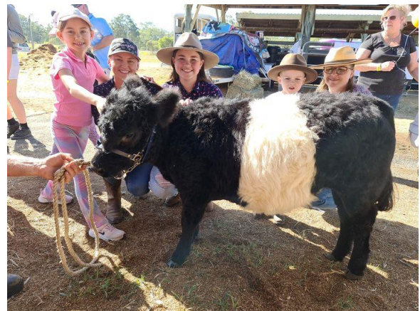
Freedom Rise Tempest enjoying kid cuddles