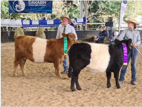
Maleny Show – Freedom Rise Silhouette & Freedom Rise Shadow.