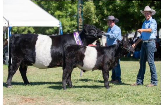
Senior & Grand Champion Female